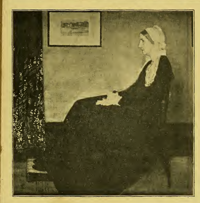
PORTRAIT OF MY MOTHER